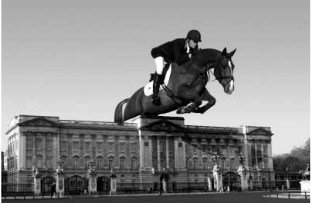
London 2012: No hurdle too large

to forget, for example, that early on Samaranch refused to sell European TV rights to Rupert Murdoch because reaching a larger audience through terrestrial channels was integral to the Olympic spirit. In doing so, the IOC accepted an offer which was $600 million less than that of News Corporation.